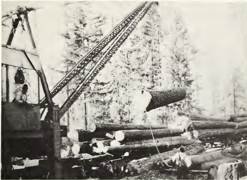
Figure 12. 1920's railroad logging on the Fourbit Creek Sale near Butte Falls, harvested by Owens-Oregon Lumber Company, Now Medford Corporation.

occurred in the Indian and Willow Creek drainages, on what was then Oregon and California Railroad (or private) land but this activity is not documented in any of the research material. Most additional sites will probably be discovered during the course of pre-sale reconnaissance by District technicians.